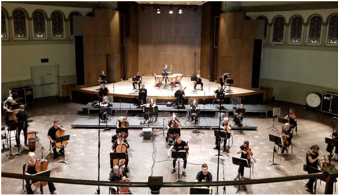
The musicians of the Orchestre Métropolitain (OM), at Bourgie Hall in Montréal, July 10, 2020, during a recording.