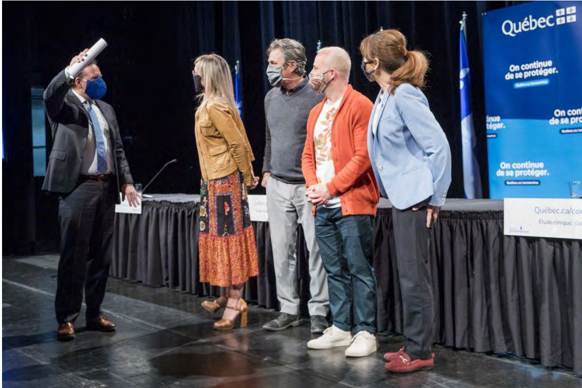
Quebec Premier François Legault, UDA President Sophie Prigent, GMMQ President Luc Fortin, Artistic Director of the OM Yannick Nezet-Séguin and Minister of Culture Nathalie Roy on June 1, 2020, at Montréal’s Place des Arts for the government press briefing.

June 4: Conference call: CNESST—MCCQ and groups in the performing arts, about health and safety in the workplace in the context of COVID-19 and the resumption of activities in various sectors. Presentation of the Guide for the Performing Arts project.