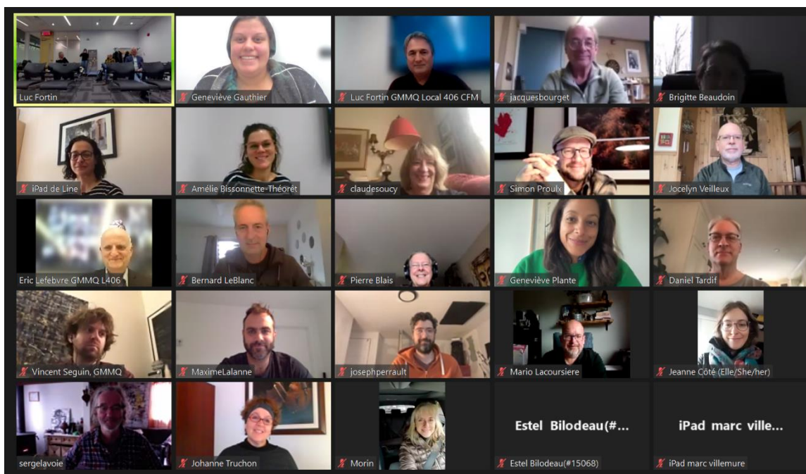
GM on October 20, 2022, hybrid formula

All General Meeting minutes are available on the GMMQ website, in your member's area.