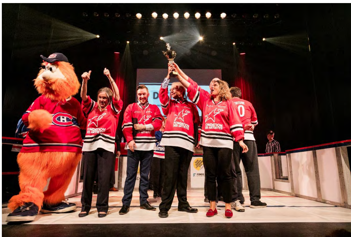
The red team won the 2 nd edition of the improv challenge

During this evening, $6,493 was raised for the Fonds Jean-Carignan.