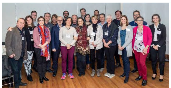
Participants at the Strategic Consultations in Quebec City on January 22, 2019.