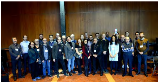
Participants of the Strategic Consultations in Montreal on January 25, 2019.