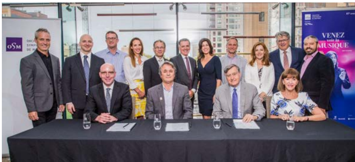
Renewal of Agreement with the OSM