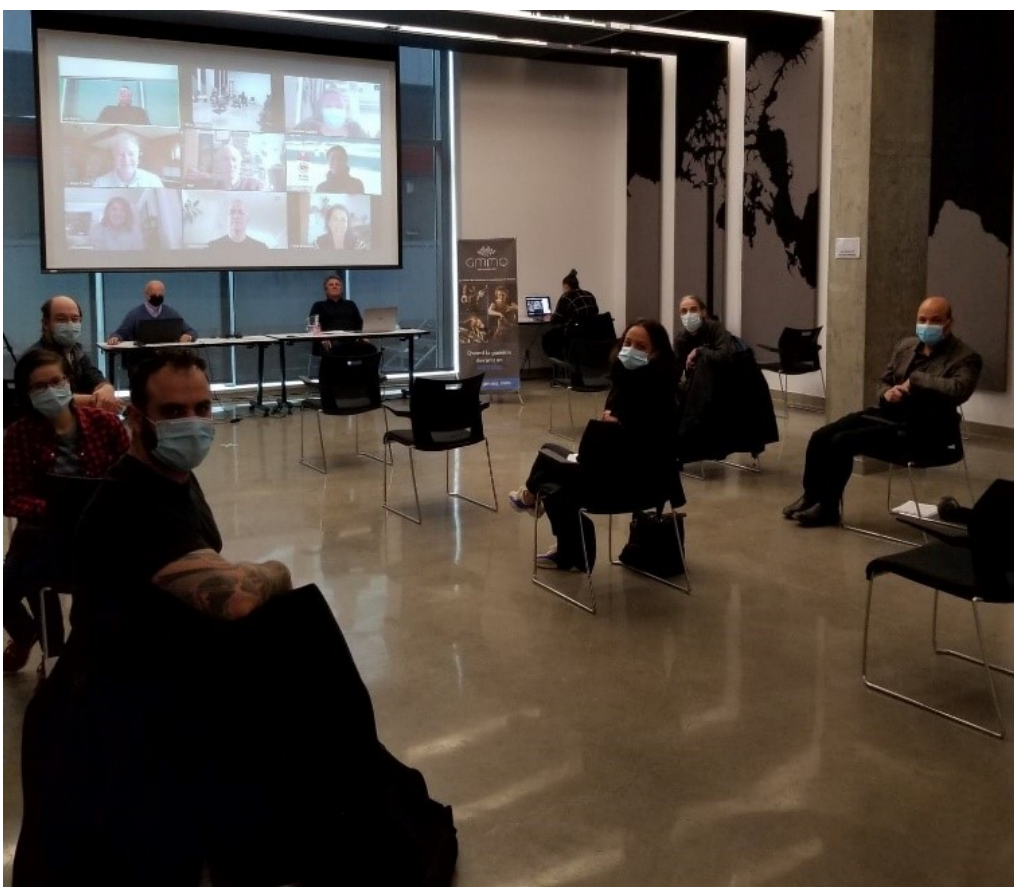
The GA in hybrid mode last April 22 at the House of Sustainable Development in Montreal.

The annual general meeting was held in a hybrid format, in person at the Maison du développement durable in Montreal, and online on zoom, a format used for the first time, in accordance with the sanitary measures in effect. A well appreciated formula which allowed to gather 40 members, a larger number than usual, from all over Quebec. It followed the nomination meeting.